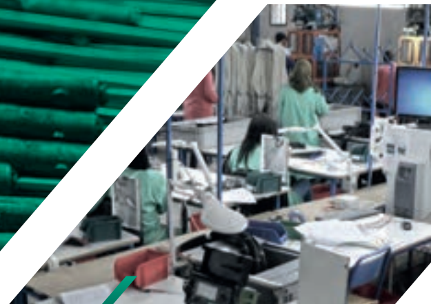
Final Testing Hammamet production plant