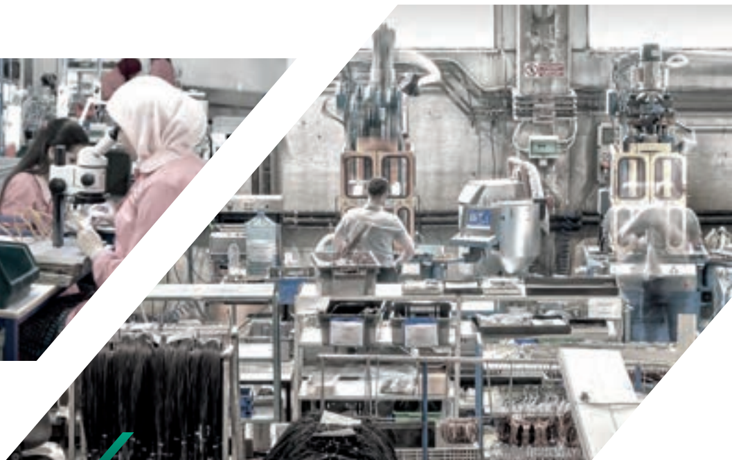
Overmoulding area, Cremona production plant