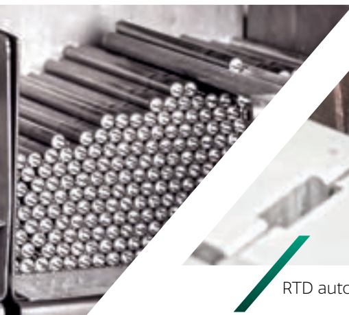
RTD automatic welding

The capability to use different production technologies enables us to make optimized products to specific applications.