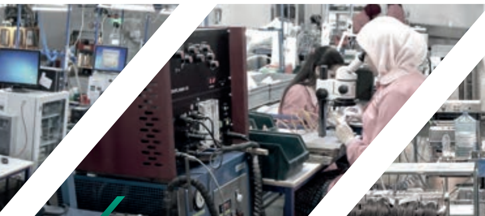
Micro Welding Hammamet production plant